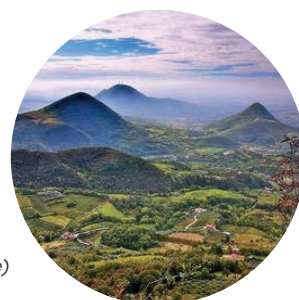
Colli Euganei (Vénétie)