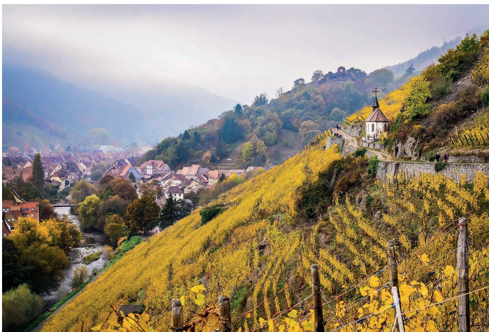
Thann from the Rangen (Alsace)

Provence : Côteaux-d'Aix-en-Provence (Château Beaulieu)